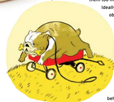
ILLUSTRATION BY BYRON EGGENSCHWILER

Take heart, though, if your pup has problems. In most cases, they can be resolved, either through basic training or one-on-one time with a trained behaviourist. Owners, however, need to take a good look in the mirror first. "The biggest thing is people have to be committed to it, and everyone the dog interacts with has to be on the same page. It's about training the people more than training the dog."